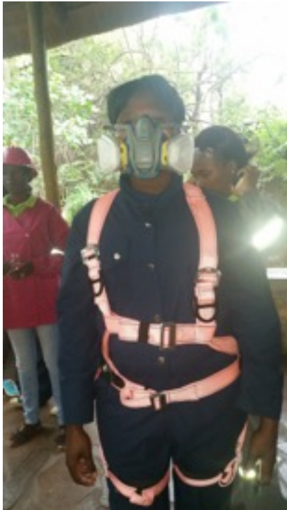
One of the Women in the Mining Sector delegates gets to grips with the personal protective equipment on offer.

Women in the Mining Sector often feel excluded from the industry and that they are not treated equally by their male colleagues - this is according to a study conducted by the Women in Mining South Africa (WiMSA) organisation, in conjunction with the School of Mining Engineering at the University of the Witwatersrand.